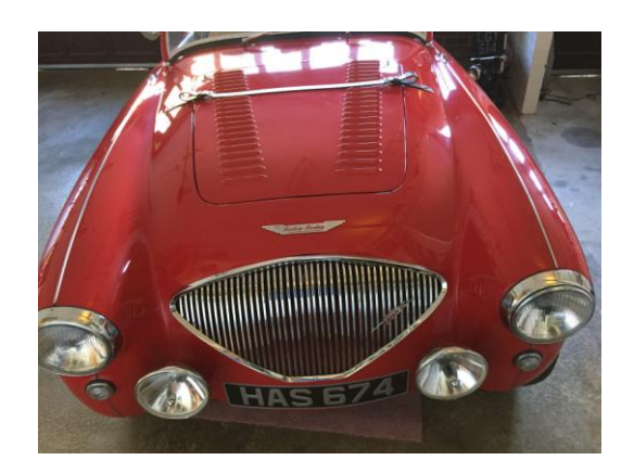
Kind regards Philip

I have changed the number plate to 33PO.